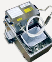
EZ Melt 18