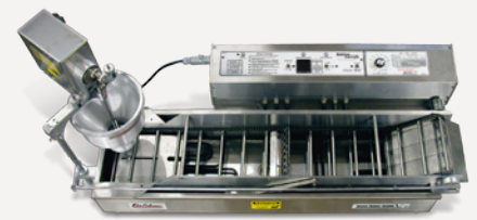
Donut Robot® Mark V / Mark V GP