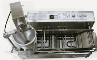
Donut Robot® Mark II / Mark II GP