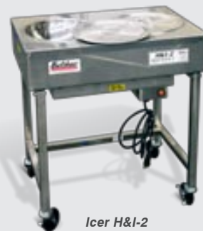
Icer H&I-2 (optional)