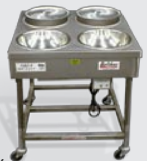
Icer H&I-4 (optional)